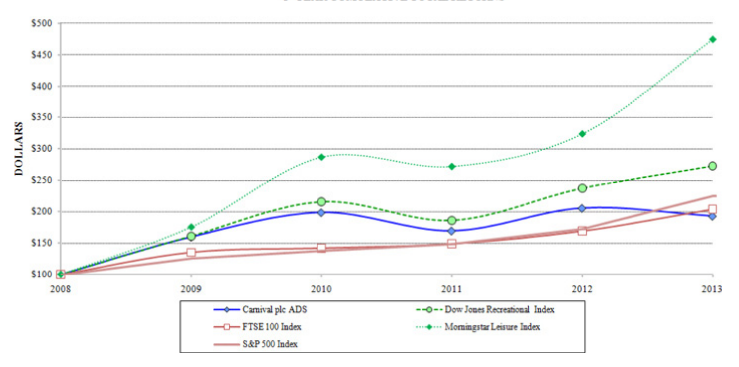
Assumes $100 Invested on November 30, 2008 Assumes Dividends Reinvested